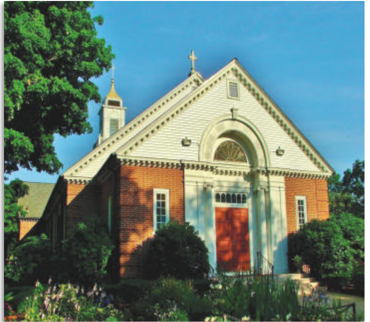
ST. VINCENT DE PAUL CHURCH

133 North Main Street, Attleboro MA 02703