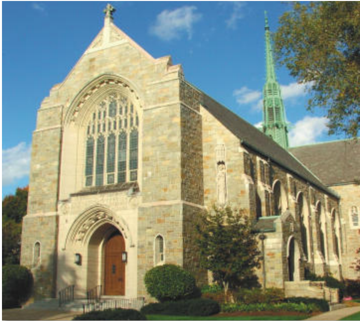
ST. JOHN THE EVANGELIST CHURCH

WORSHIPPING AT SAINT JOHN THE EVANGELIST & SAINT VINCENT DE PAUL PARISHES