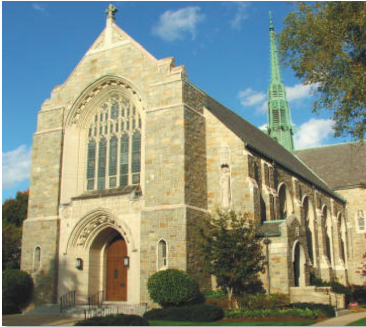
ST. JOHN THE EVANGELIST CHURCH

WORSHIPPING AT SAINT JOHN THE EVANGELIST & SAINT VINCENT DE PAUL PARISHES