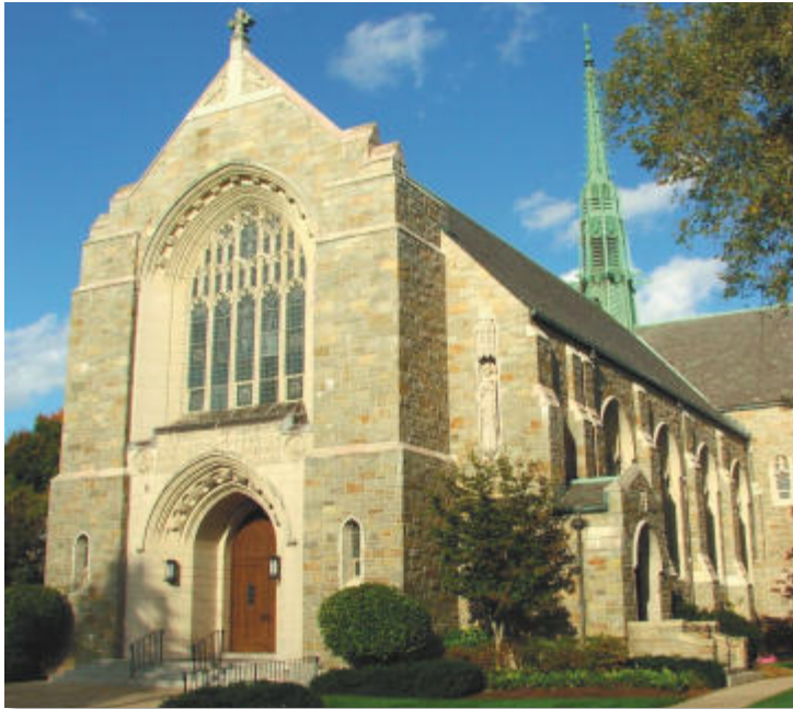
ST. JOHN THE EVANGELIST CHURCH

WORSHIPPING AT SAINT JOHN THE EVANGELIST & SAINT VINCENT DE PAUL PARISHES