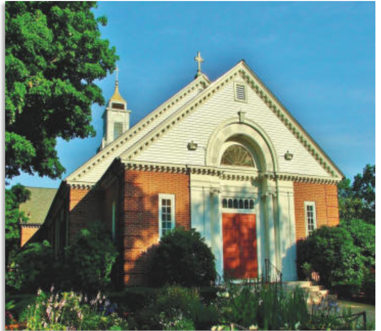
ST. VINCENT DE PAUL CHURCH

133 North Main Street, Attleboro MA 02703