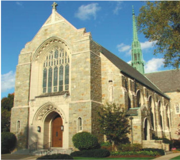
ST. JOHN THE EVANGELIST CHURCH

WORSHIPPING AT SAINT JOHN THE EVANGELIST & SAINT VINCENT DE PAUL PARISHES