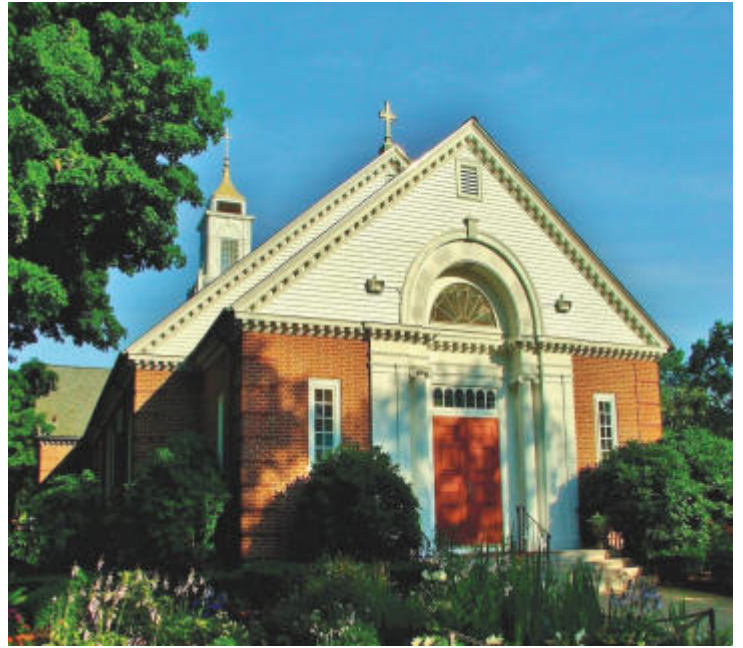
ST. VINCENT DE PAUL CHURCH

133 North Main Street, Attleboro, MA 02703